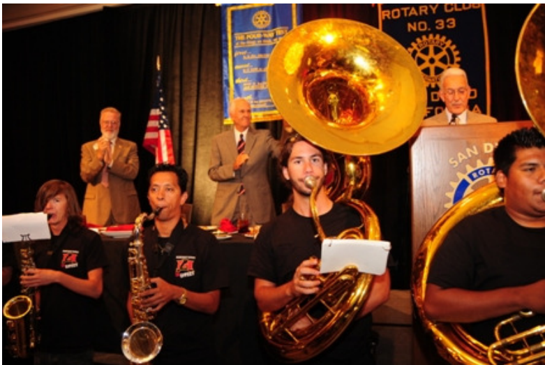
SDSU Marching Aztecs