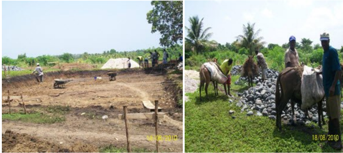
The Good Samaritan School, Ile a Vache, Haiti