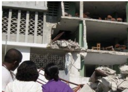
College Catherine Flon, Carrefour, Haiti