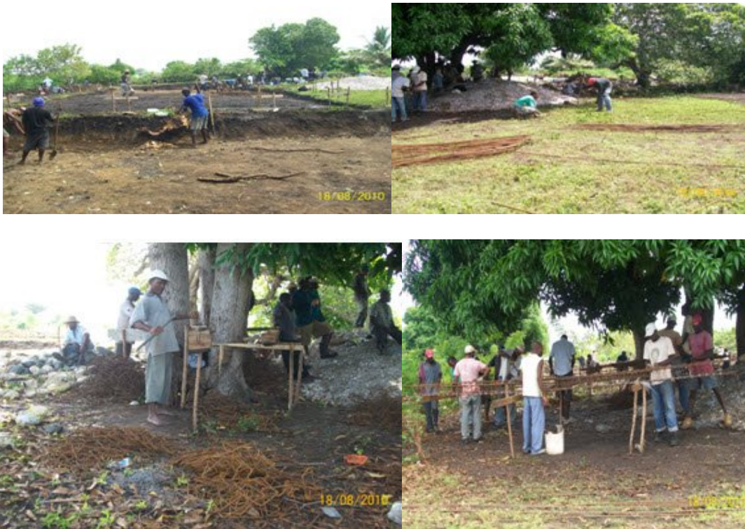
The Good Samaritan School, Ile a Vache, Haiti