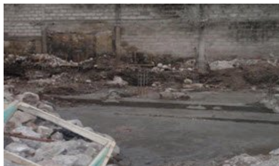
La Sainte Famille Elementary School