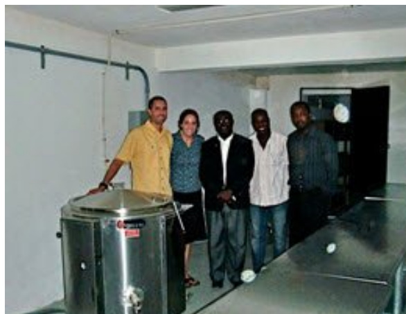
Generator for Super Kitchen