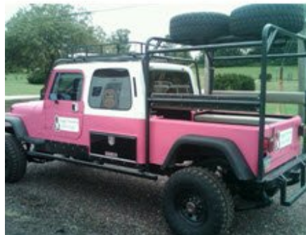
Midwives for Haiti, Henche, Haiti