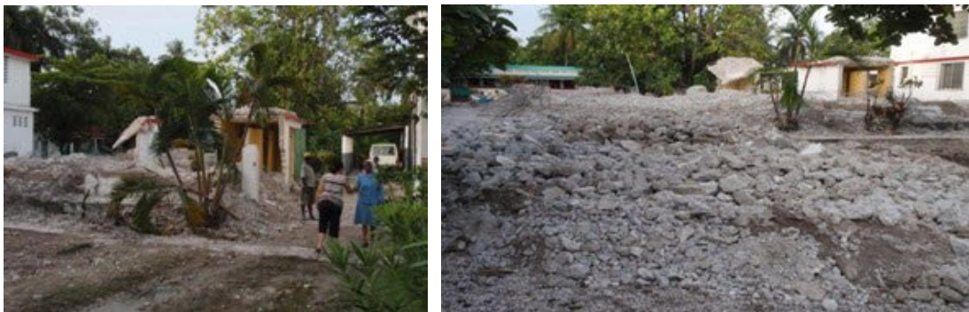
Ecole Normale, Les Cayes, Haiti